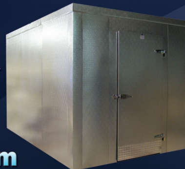
Storage Walk-In Cooler